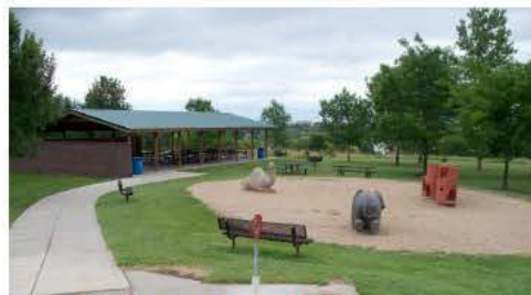
Chalco Hills Picnic Area

(See page 8 for more picnic information and map)