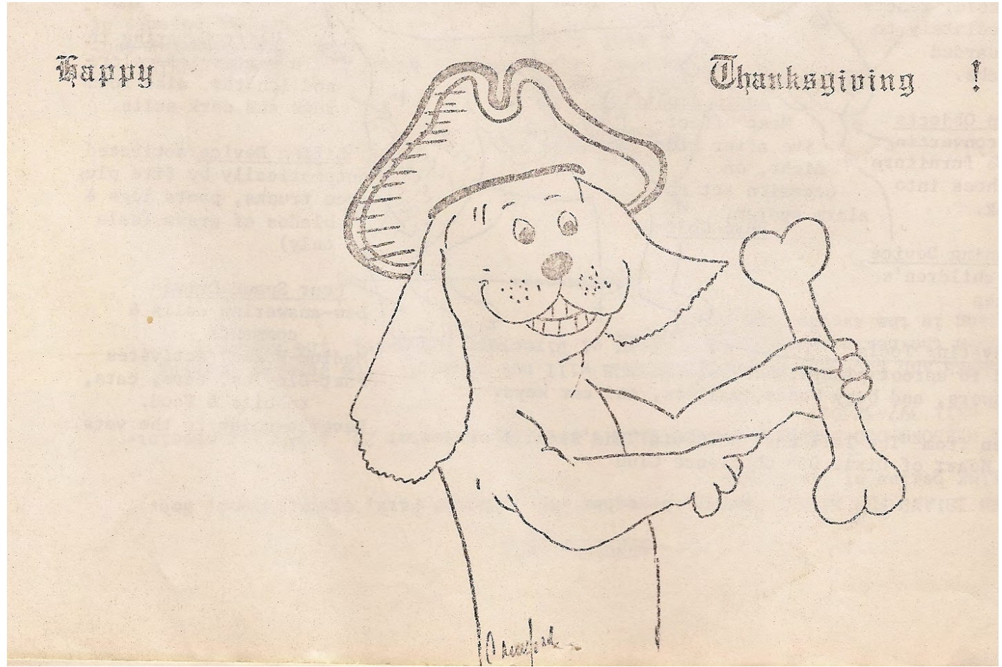
---Reprinted from November 1976, Growlers Gazette